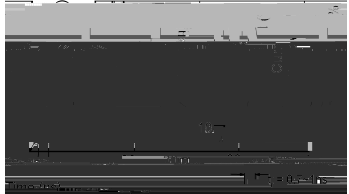
Fig3: Clamping voltage vs. Peak pulse current