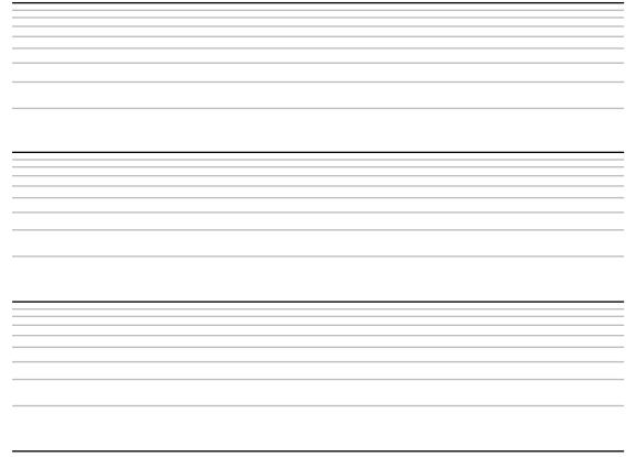
Figure 14. Safe Operation Area